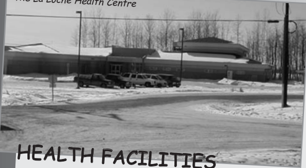
The La Loche Health Centre