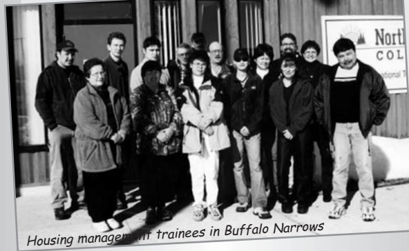
Housing management trainees in Buffalo Narrows